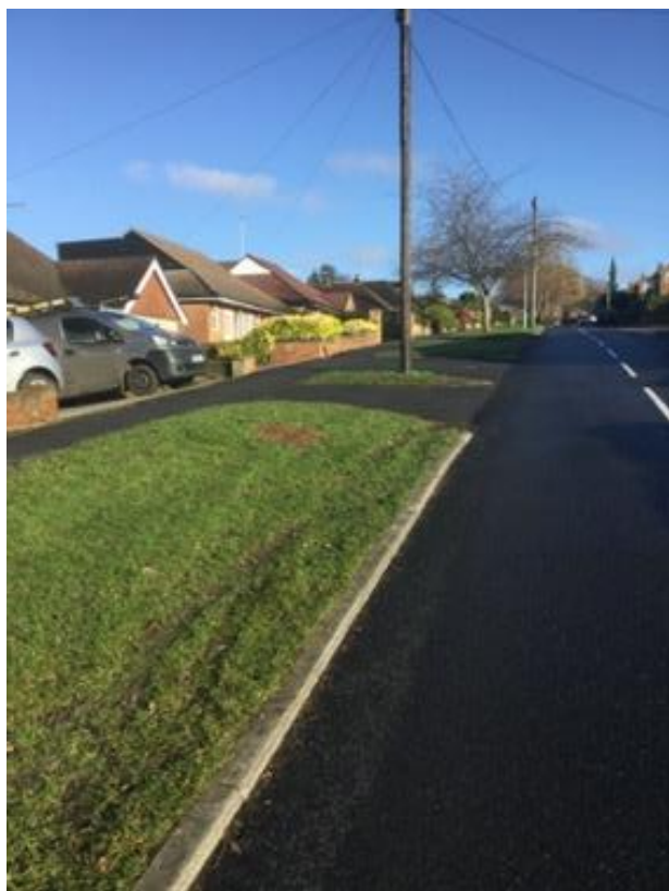
Appendix 13 (a) Verges Review 20191129 V3